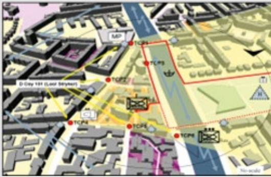
Situation map (3D)