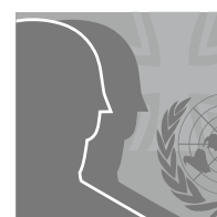
DEFENCE & SECURITY

IABG Einsteinstrasse 20 85521 Ottobrunn Germany Phone +49 89 6088-2030 info@iabg.de www.iabg.de