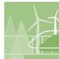
MOBILITY, ENERGY & ENVIRONMENT