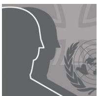
DEFENCE & SECURITY