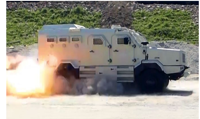
Blast test on a protected military vehicle