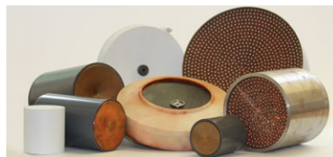
Selection of available threats