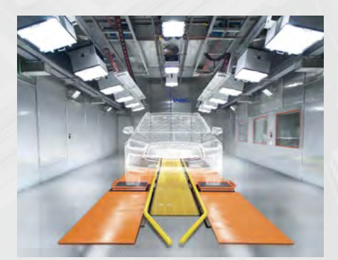
Complete vehicle validation