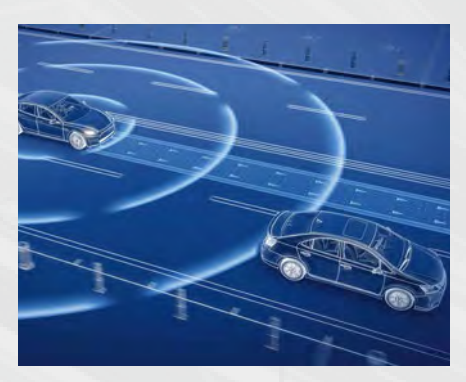
safeHAD • SOTIF