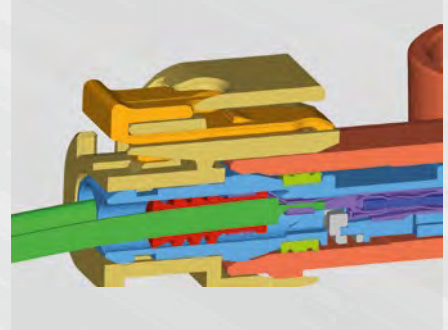
Qualification of connectors