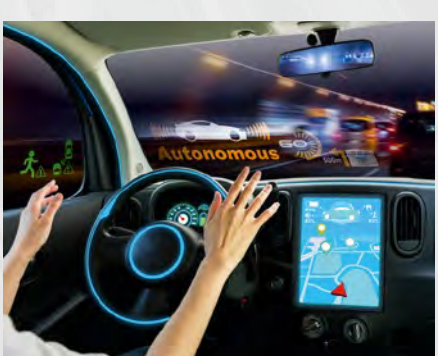
Sensor system validation