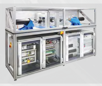
Test benches for active vehicle components