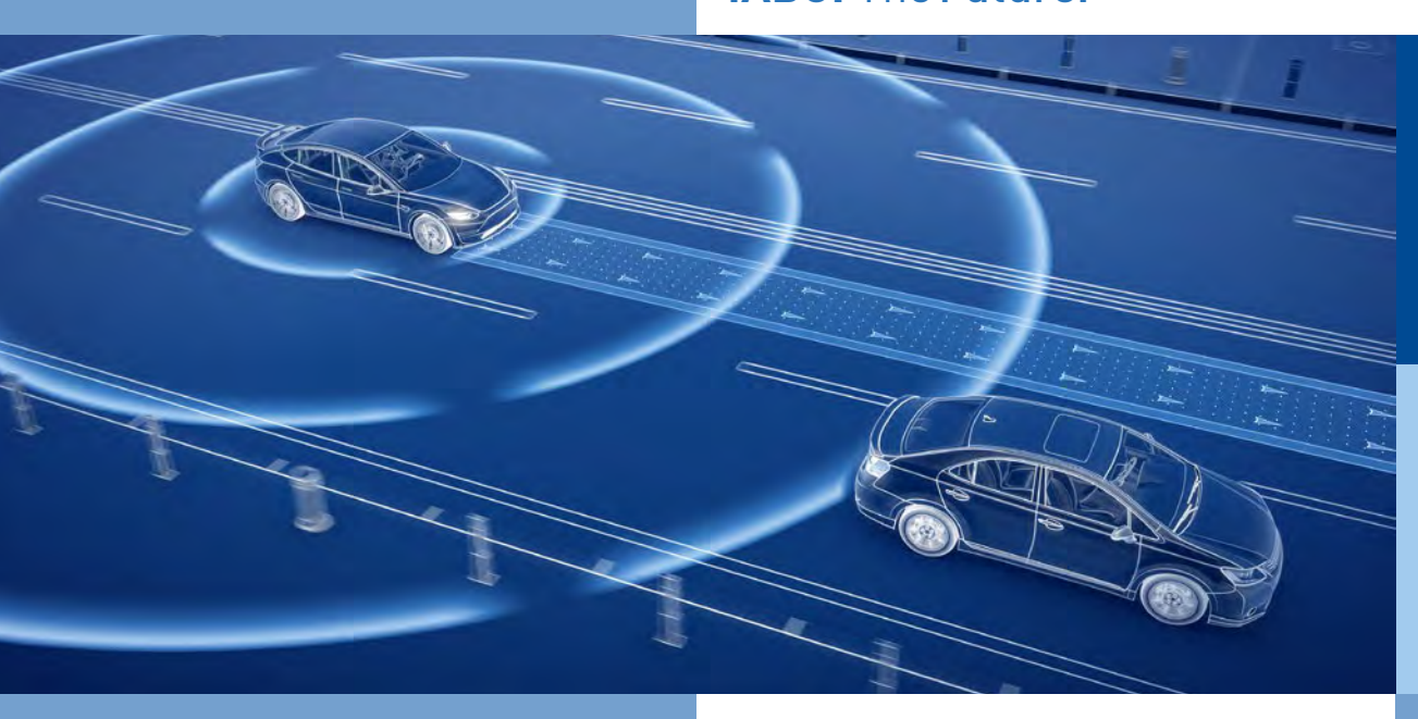
IABG. The Future.