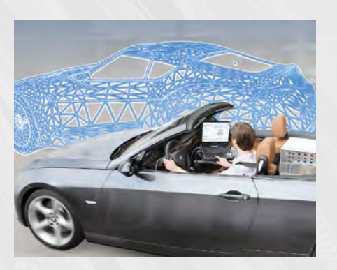
Functional reliability and human factors