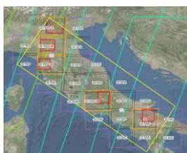
Italy (160 000km 2 )