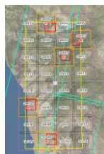
Namibia (220 000km 2 )