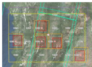
Colombia (200 000km 2 )

Selected classification algorithms will be tested on 5 test sites (Colombia, Germany, Italy, Namibia and China).