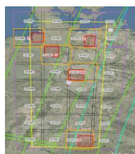
Germany (190 000km 2 )